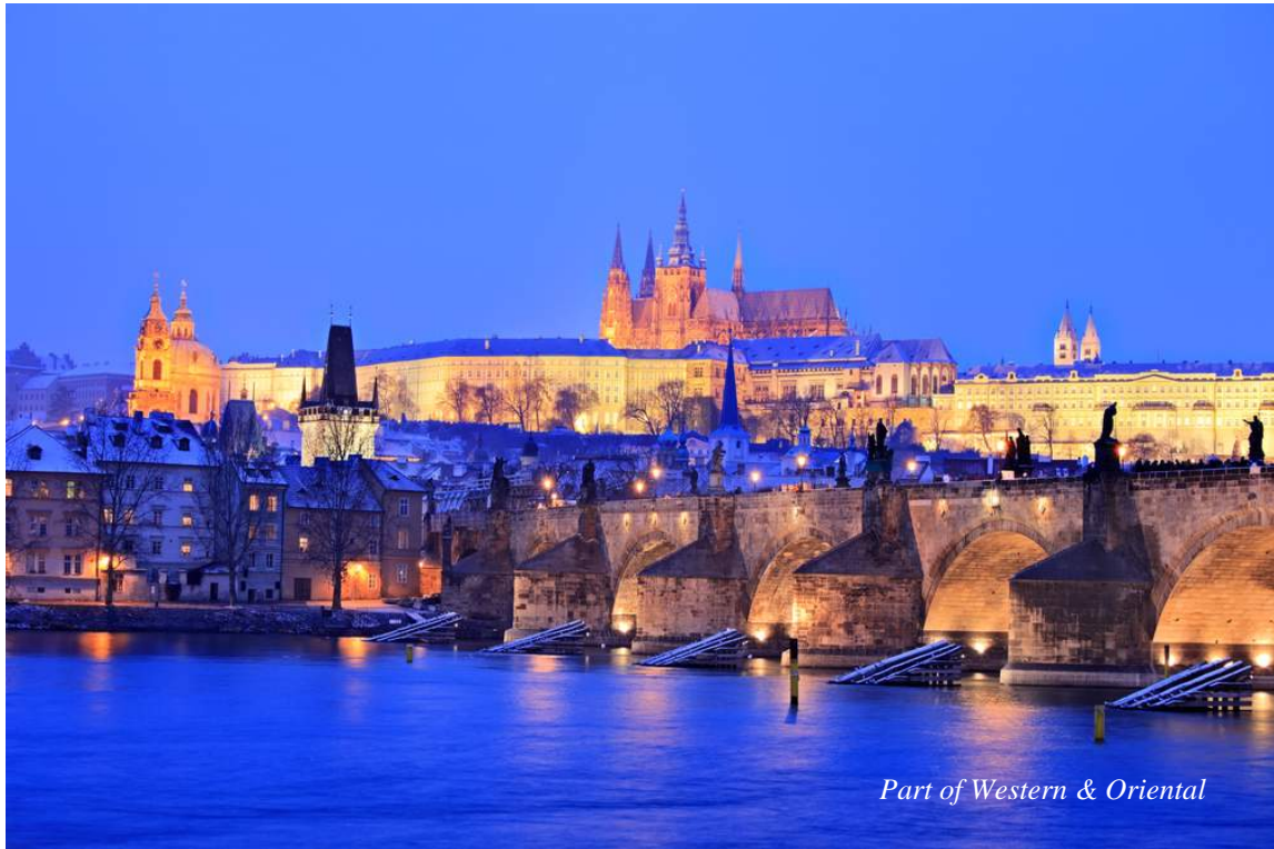
Part of Western & Oriental

3 nights from £350 per person inc flights, hotel & dinner